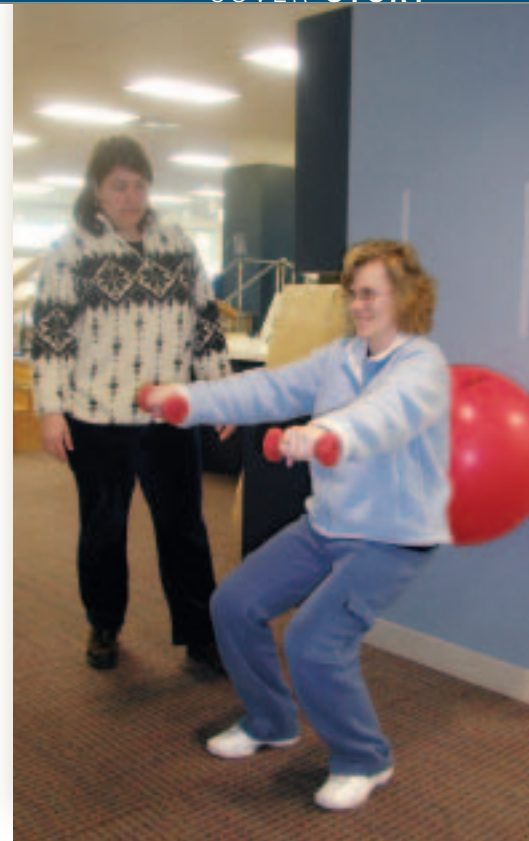
Rehabilitation can help the MS patient maintain strength and balance.

Despite the uncertain prognosis for the MS patient, research shows that early treatment is key and can help to slow the progress of the disease. The agents used to treat the