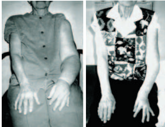
These “before-and-after” images show how lymphedema can be reduced if patients get the right combination of treatments.