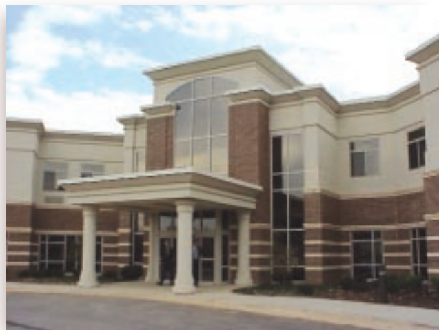
Kessler Adventist Rehabilitation Hospital, Rockville, Maryland

More daunting than design and construction was the critical task of developing the bylaws that would govern the hospital, as was putting